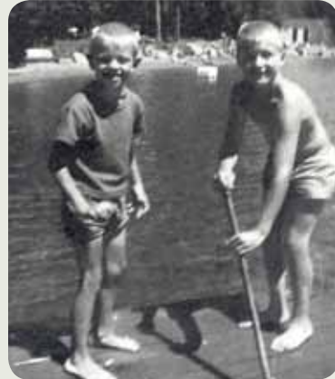
Guess who the two boys are!

Mail answers to LHA or email to: lakeharveyassociation@lakeharvey.com .