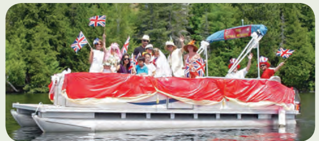
2 nd Place - A Royal Wedding