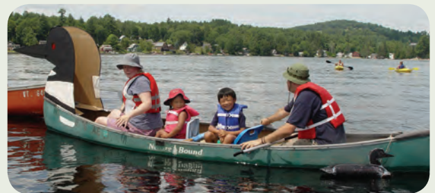
Non Motorized Entry - Mother Loon & Baby