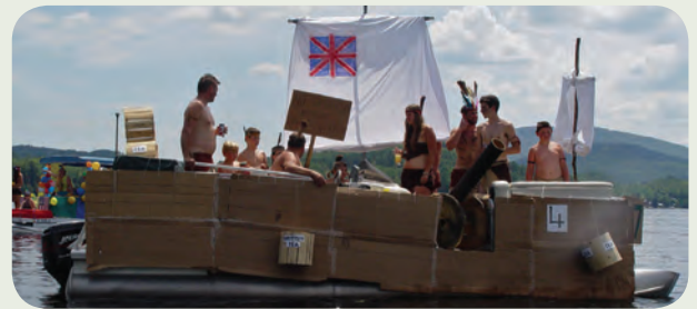
1 st Place - Boston Tea Party