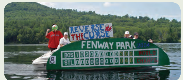
3 rd Place - Reverse The Curse